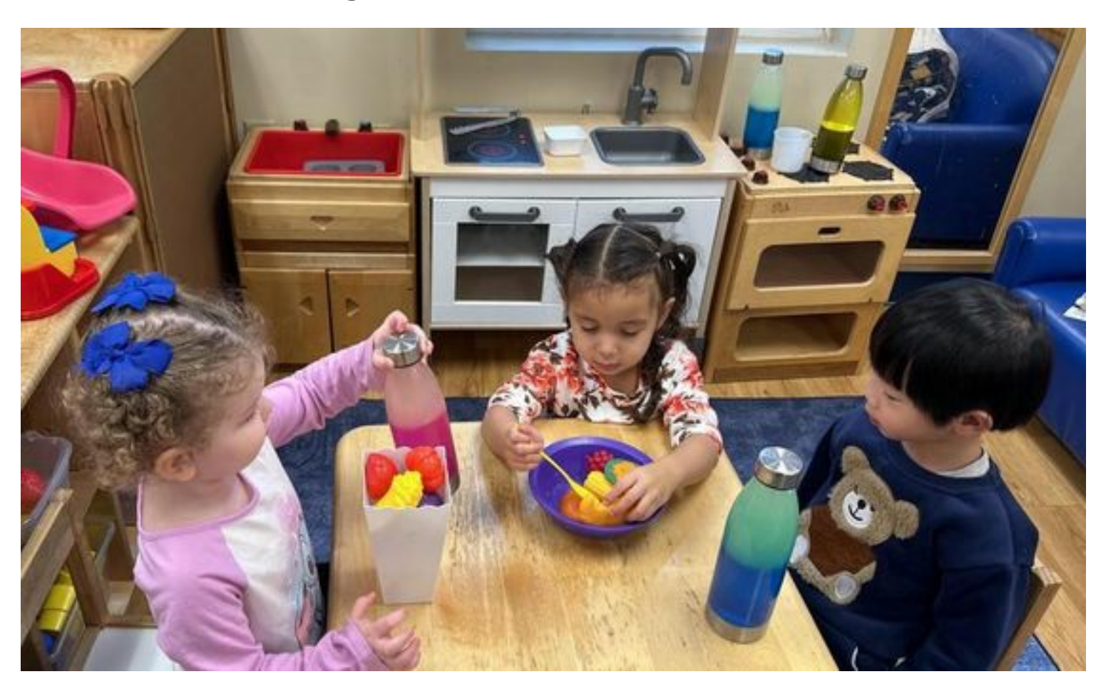
Friends sit down for 'dinner.'