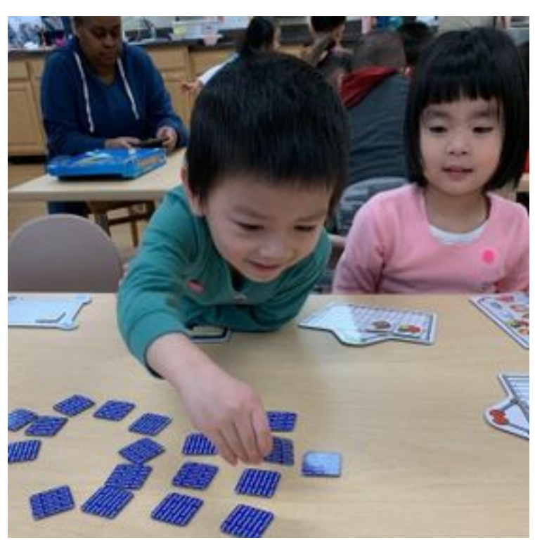
Playing a memory game.