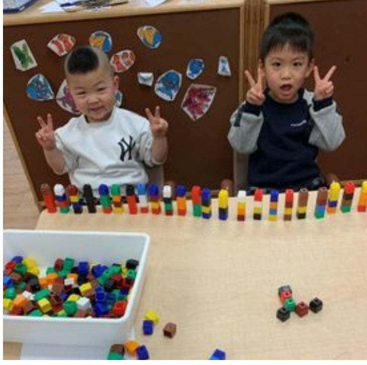
They build lots of colorful towers with unifix cubes!