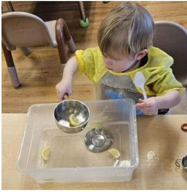
Making "lemonade" in this water sensory experience.