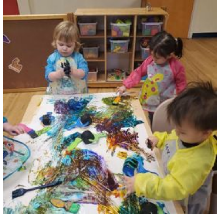
Our toddlers get creative with paint and rollers!