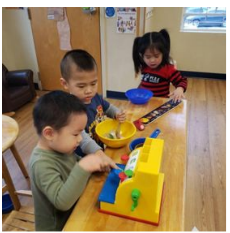
Friends play 'restaurant' in Dramatic Play Area.