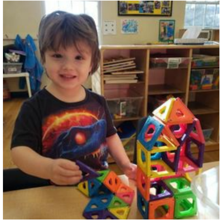
Building an amazing structure with magnet tiles!