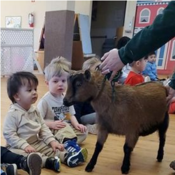
The toddlers are very interested in the goat!