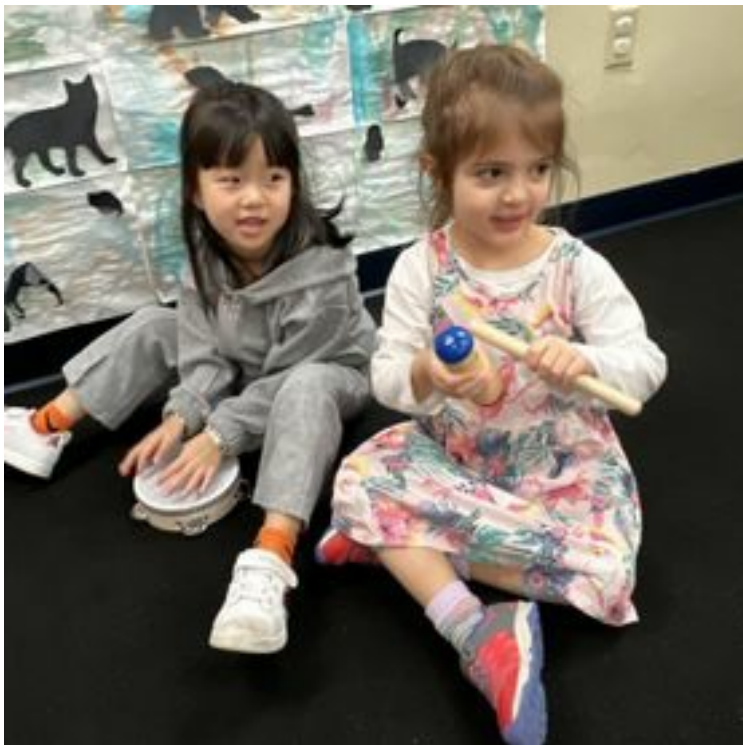
Having fun making music!