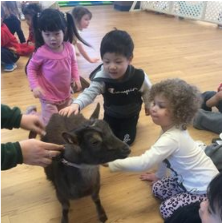
A few Classroom 2 friends get to know a goat!