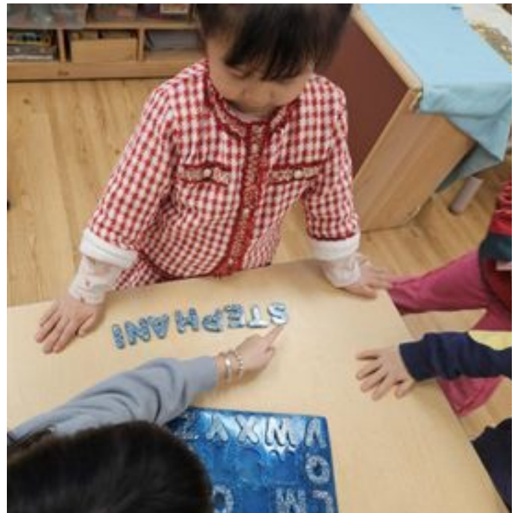
Using letters from the puzzle board to make their names.

Thanks for reading! Please let us know if you have any questions.