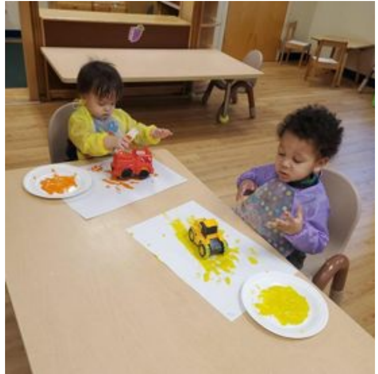
Two of our toddlers make tracks with trucks and paint!