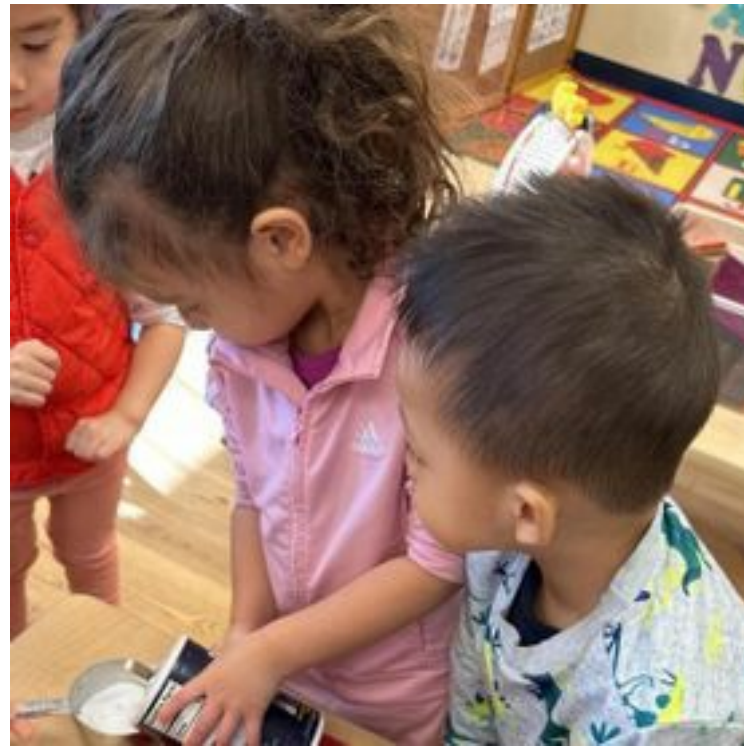
She is pouring salt for the Play-Doh the students are making!