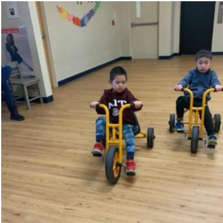
Our friends ride on trikes in the community room.