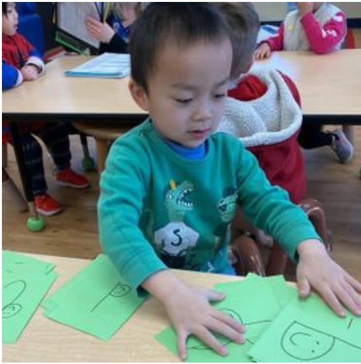
In Room 4, Caden plays a letter game.